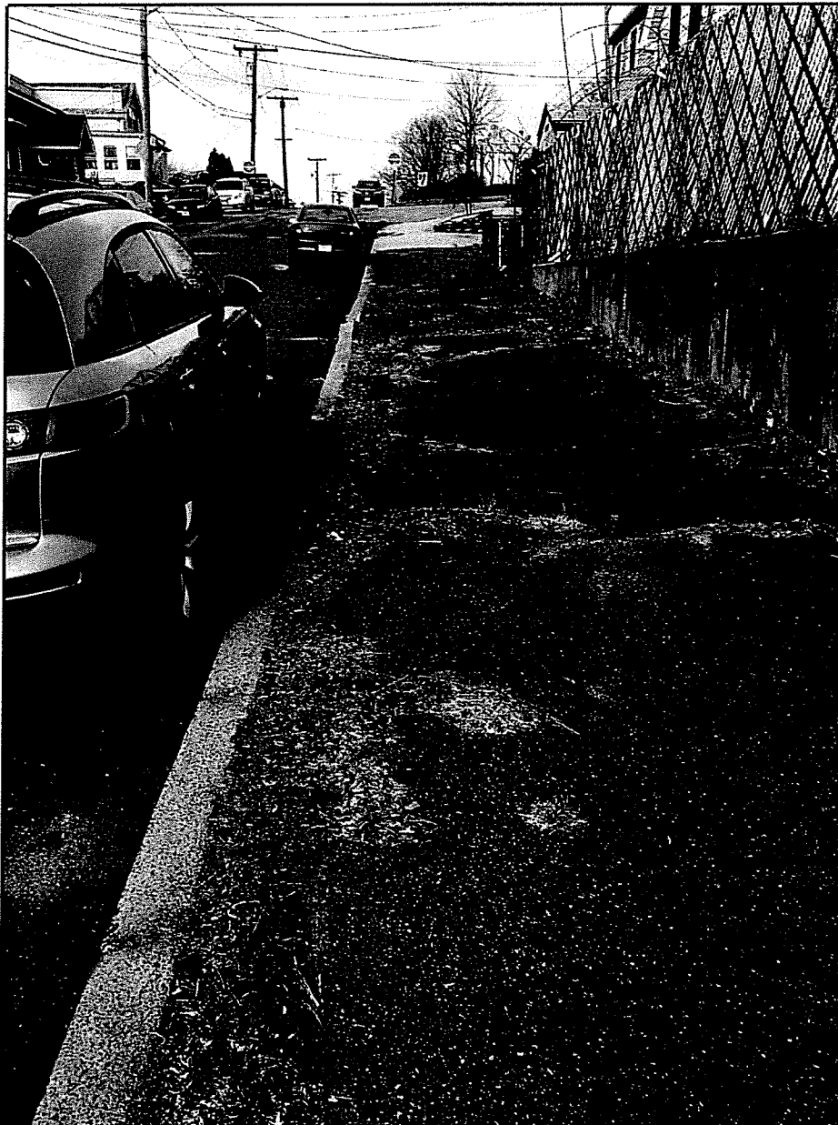
Photo highlighting various curbing materials on the street and section of sidewalk in poor condition.