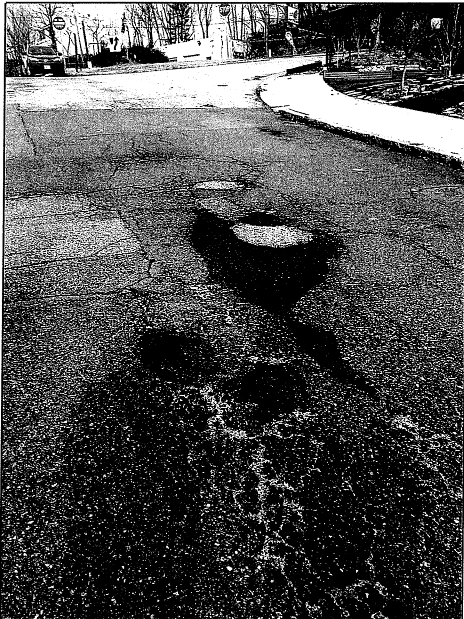
Photo highlighting worst section of roadway close to 1A